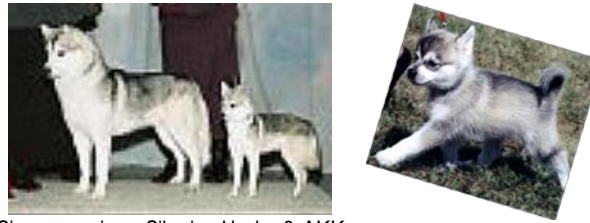
Size comparison; Siberian Husky & AKK

The overall appearance of the AKK reflects the breed's northern heritage. He is very curious, active, quick and agile. He is loyal and affectionate with family members, but can be reserved and cautious with strangers and in unfamiliar situations. Obedience training is highly recommended for socialization.